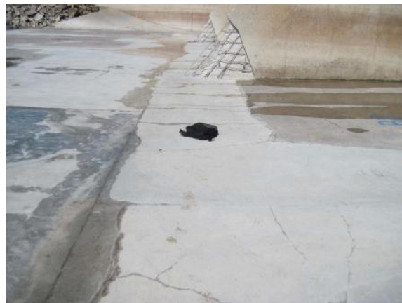
Extensive shrinkage cracking appears 1-2 weeks after pouring concrete mix without PREVent-C.