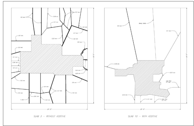
Test slab with PREvent-C (right) showed a 90% reduction in shrinkage cracking when compared to control slab (left).