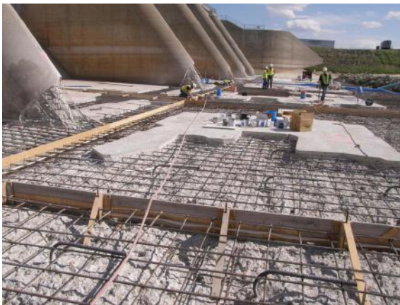
Islands of sound concrete remain after removing uneven depths of deteriorated concrete.

The existing concrete in both the inlet apron and the pier noses/gate structure had extensive deterioration due to freeze-thaw damage which promoted alkali-silica reaction. The repair procedure consisted of removing deteriorated concrete using hydro-demolition and replacing new concrete back to the existing lines and grades. Due to uneven deterioration, the removed concrete varied from full-depth removal (18") to intermediate removals ranging to the areas of sound concrete. The islands of good concrete were saw-cut at sharp angles (image 1). Further, the replacement concrete coarse aggregate was only locally available in 1/2" nominal, which further increased concerns regarding shrinkage cracking.